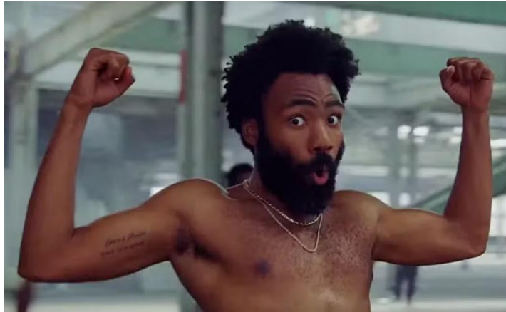
Childish Gambino (Donald Glover) no clipe de 'This Is America', seu grande sucesso

Donald McKinley Glover (25 de setembro de 1983) é um ator, roteirista, humorista, rapper e cantor americano. Ele se apresenta no cenário musical usando o nome artístico Childish Gambino e como DJ usa o nome mcDJ . Glover primeiro chamou a atenção por seu trabalho no grupo Derrick Comedy, e é mais conhecido por escrever para o seriado 30 Rock e pelo seu papel como Troy Barnes na série de comédia da NBC, Community .